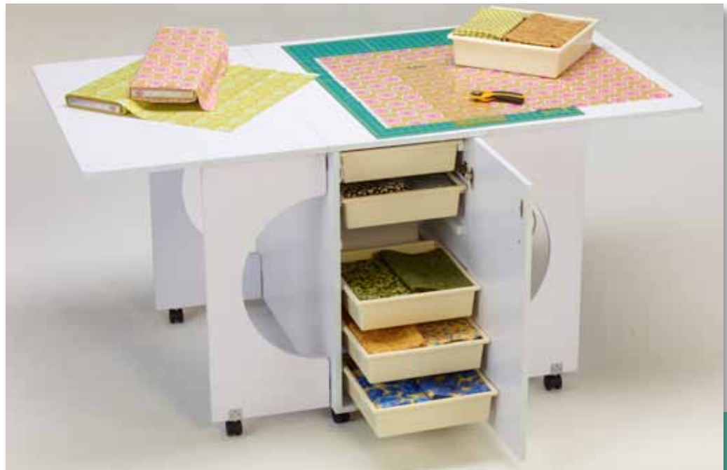
Fully open - back side