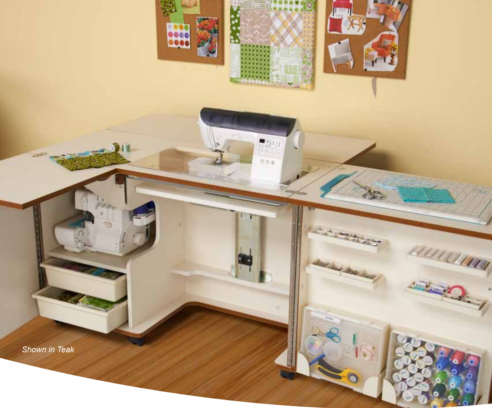
Shown in Teak