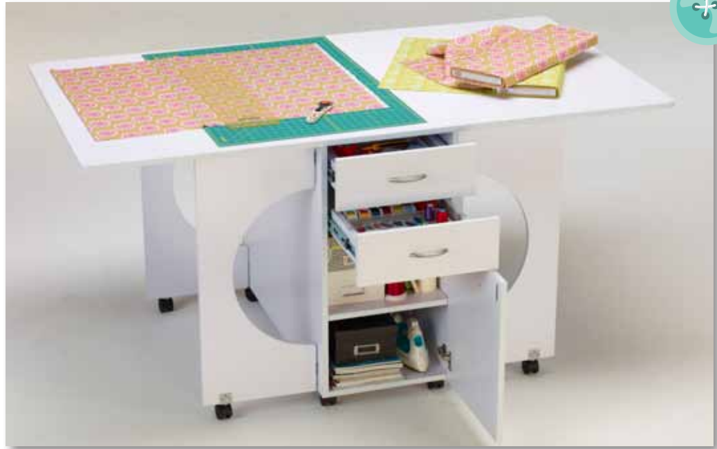
Fully open - front side