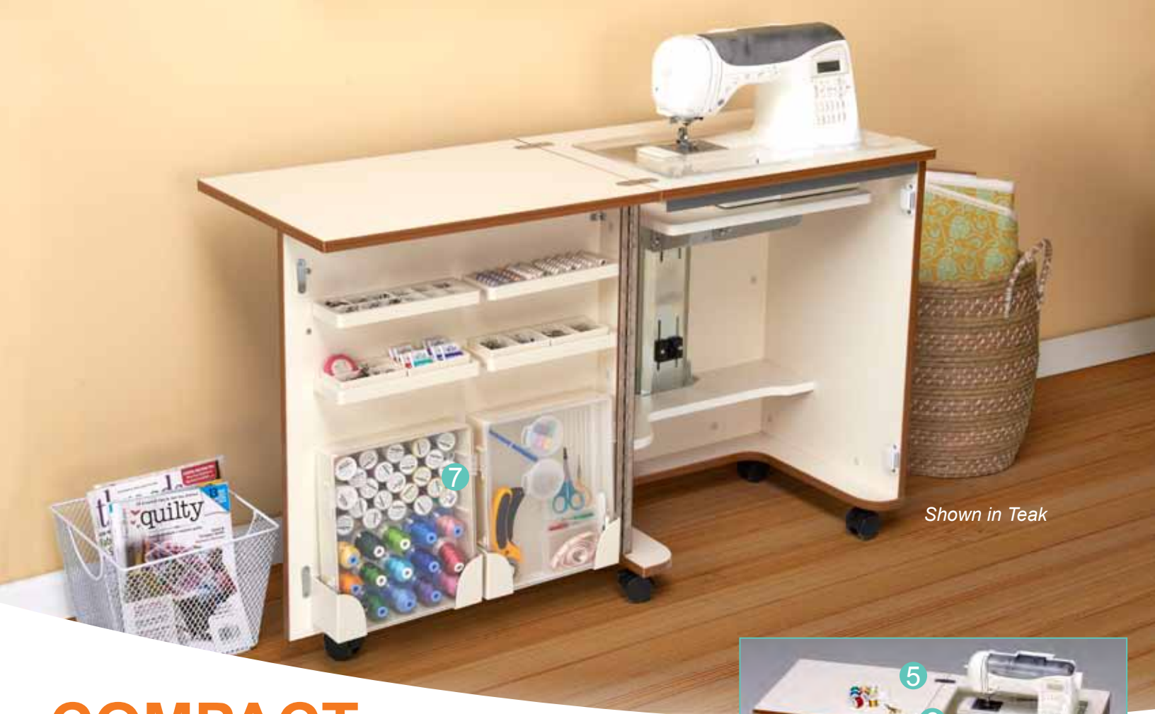
Shown in Teak