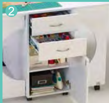
Full-Extension Drawers, Adjustable Shelving