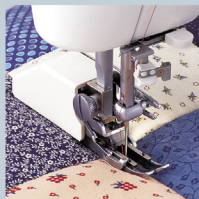
Upper Feed Presser Foot