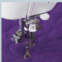
Quilting Foot Front Open Toe