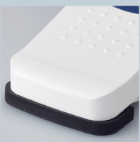
Foot Switch Stopper