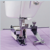
Quilt Guide for Upper Feed Presser Foot