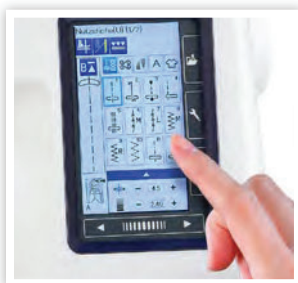
TOUCH SCREEN WITH 13 LANGUAGES