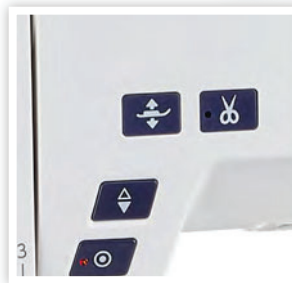
AUTOMATIC PRESSER FOOT LIFT