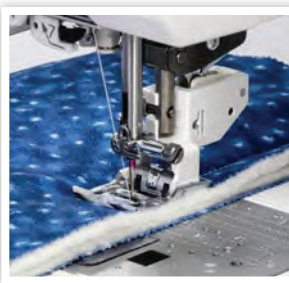
ACUFEED FLEX FABRIC FEEDING SYSTEM