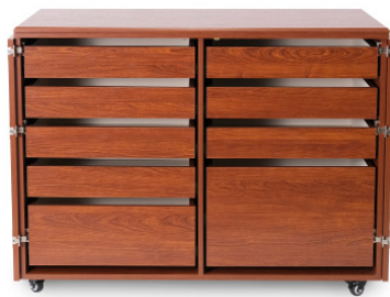
Dingo II Cutting Table

Kangaroo sewing cabinet - check! Now complete your studio with Kangaroo storage and cutting furniture, specially designed to complement your primary workstation. With extra storage and workspace, you can customize your sewing room to be stylish, comfortable, and even more productive!