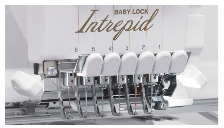
Six Efficient Needles With six needles, you'll love how quickly you can embroider large, multi-colored designs. And if you're running an embroidery business, you can finish projects

Choose from 86 built-in embroidery designs with 60 exclusive designs. You'll find inspiration for any embroidery project ready to go at the touch of a button.