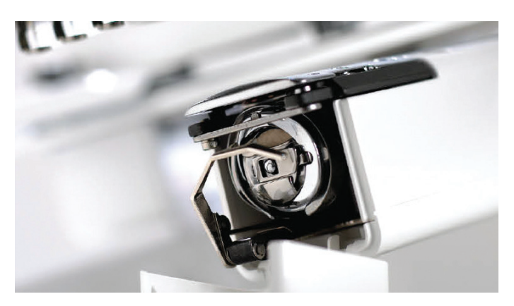
Convenient Bobbin System

The Intrepid comes with four hoops, giving you more options to match to your projects every time and provides stability from the smallest to the largest hoop size.