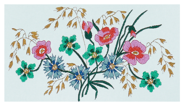
86 Embroidery Designs

The Needle Beam highlights your needle position so you know exactly where embroidery will start. Your embroidery will be perfectly placed every time.