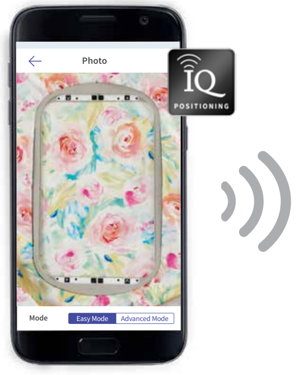
App download required for Android and iOS smartphones.

Baby Lock machines come with features that make sewing easy no matter what you want to create. These innovative features, powered by Baby Lock IQ™ Technology, work with the "brain" of your machine to achieve the results you desire. Taking your creative journey with IQ Technology makes it easy to bring your vision to life.