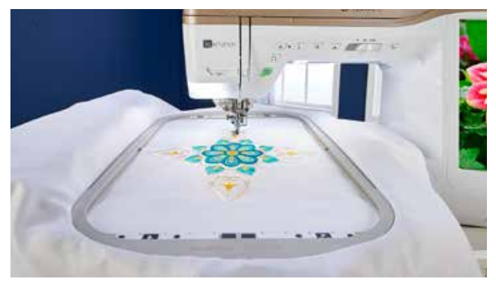
9-1/2" x 14" Embroidery Field

Stitch bigger embroidery designs and enjoy less re-hooping with a large embroidery field.