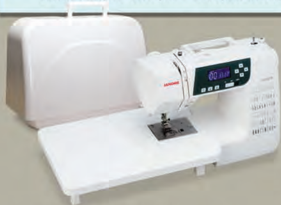
3160QDC shown with included Hard Cover and extension table. (Optional on 2160DC)

*2160DC has Superior Feed System™ with 7-piece feed dog