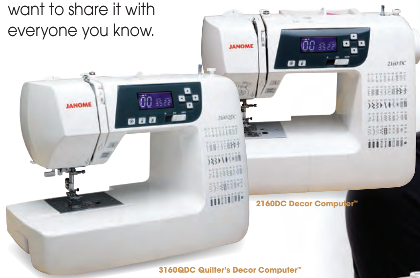
2160DC Decor Computer™

You love to quilt, sew your own home decor, and express your creativity with fabric. You need a machine that makes it effortless and fun. One that gives you top-of-the-line performance and features at a basic-machine price. We made the 2160DC Decor Computer™ and 3160QDC Quilter's Decor Computer™ machines just for you. When creativity is this easy, you'll want to share it with everyone you know.